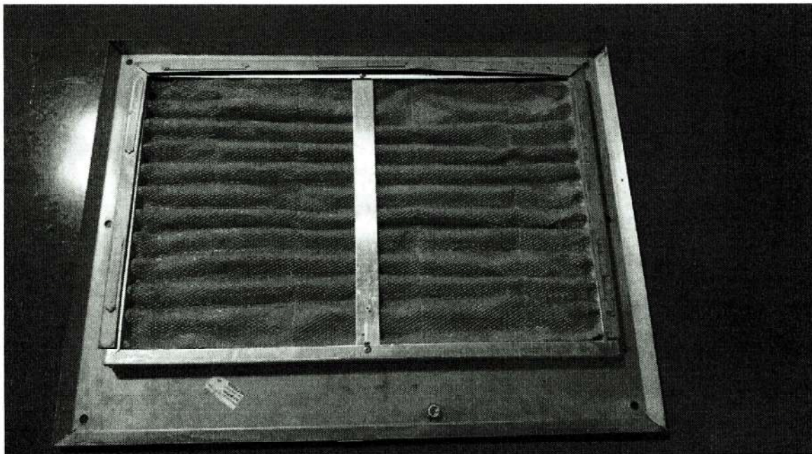
Fig : Box type filter fixed in grill assembly