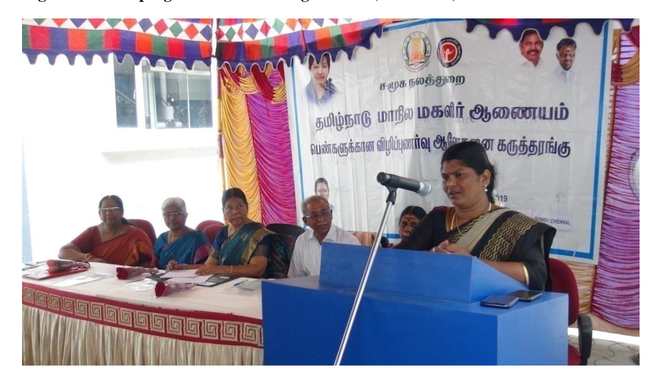
Tamil Nadu State Commission for Women in association with National Commission for Women conducted Legal awareness programme at BCGVL.