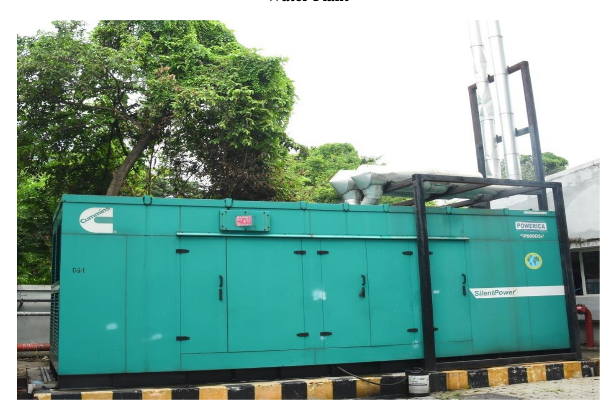
Diesel Generator with 600KVA capacity