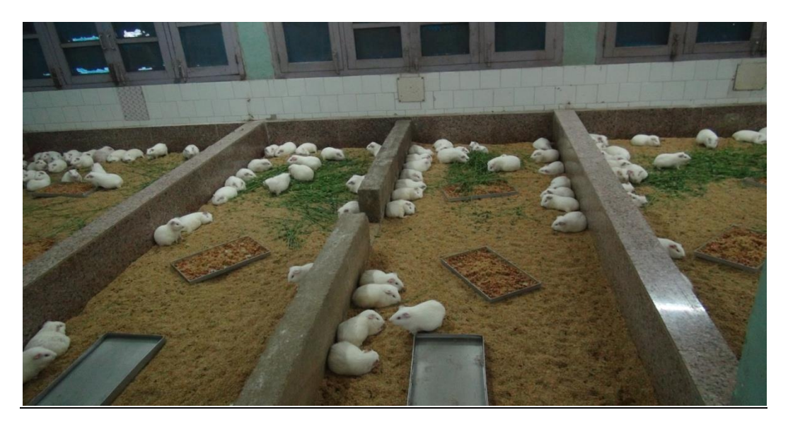
Guinea pigs in deep litter system