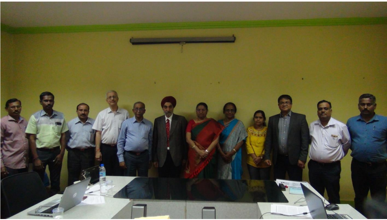
BCGVL facilitated Central TB Division of Ministry of Health and Family Welfare to organise a two days expert committee meeting on 17th and 18th January 2019 to assess possibility of production of PPD at BCGVL for programmatic purpose.