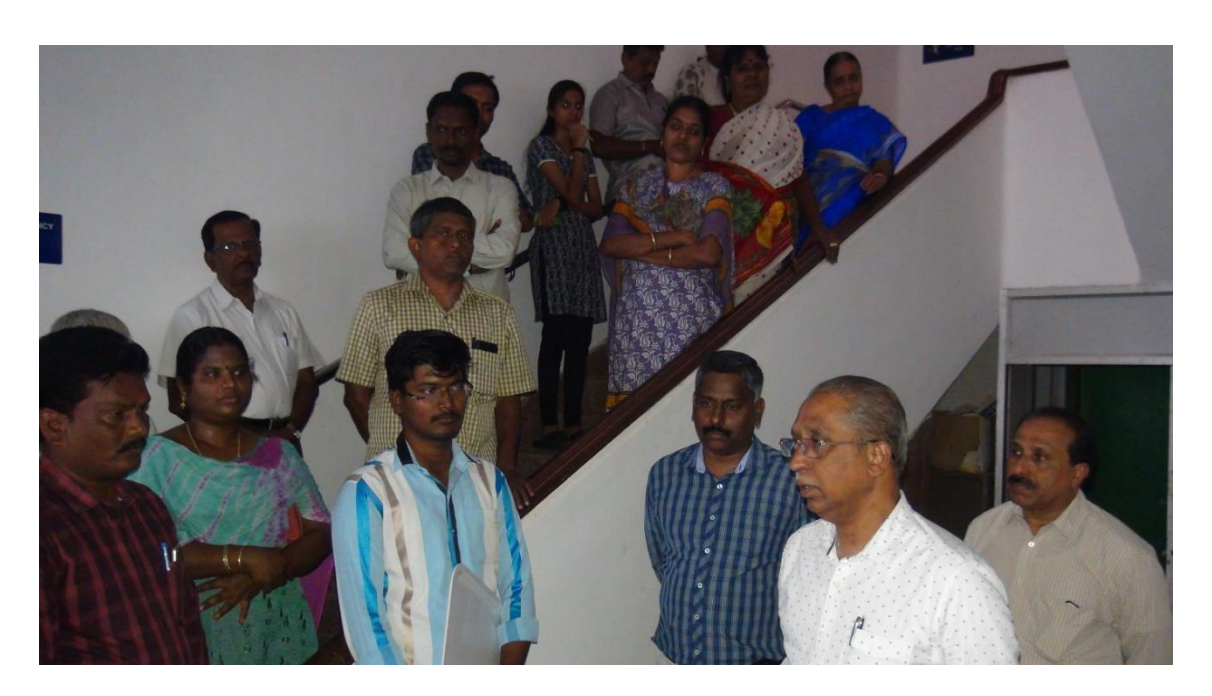
Director, BCGVL inaugurated Aadhar based Biometric attendance system at BCGVL and CCTV cameras installed at various locations at BCGVL made operational.