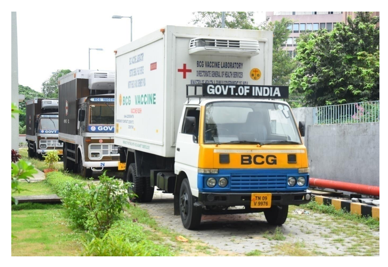
Refrigerated vehicles used for transporting vaccine