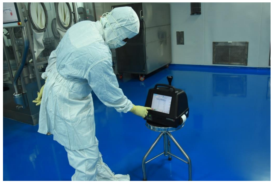
Online particle counter