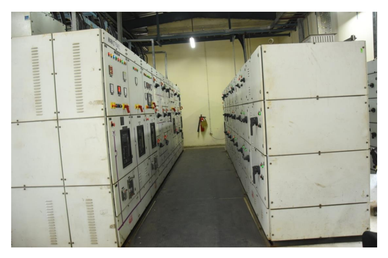
1025 kVA Electrical Distribution station