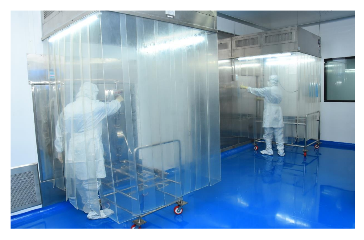
Autoclave and DHS unloading area