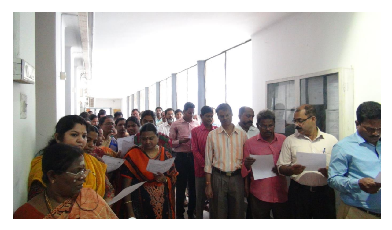
A pledge taking ceremony was conducted against corruption.