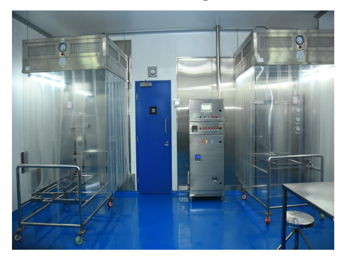
Autoclave and DHS loading