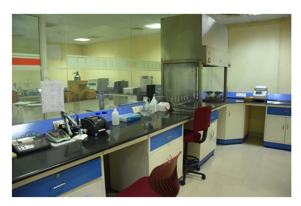
Water testing lab