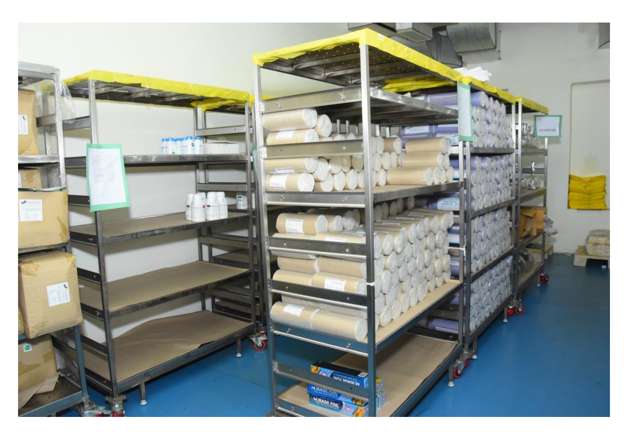
Test pass material store