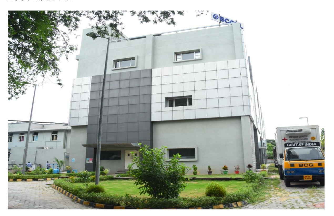
BCGVL Front View