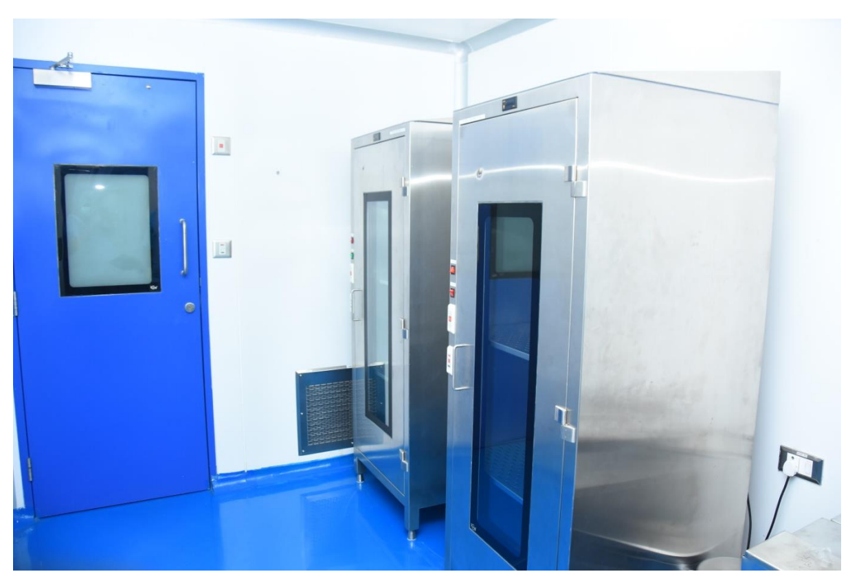
Dynamic Garment Cubicle