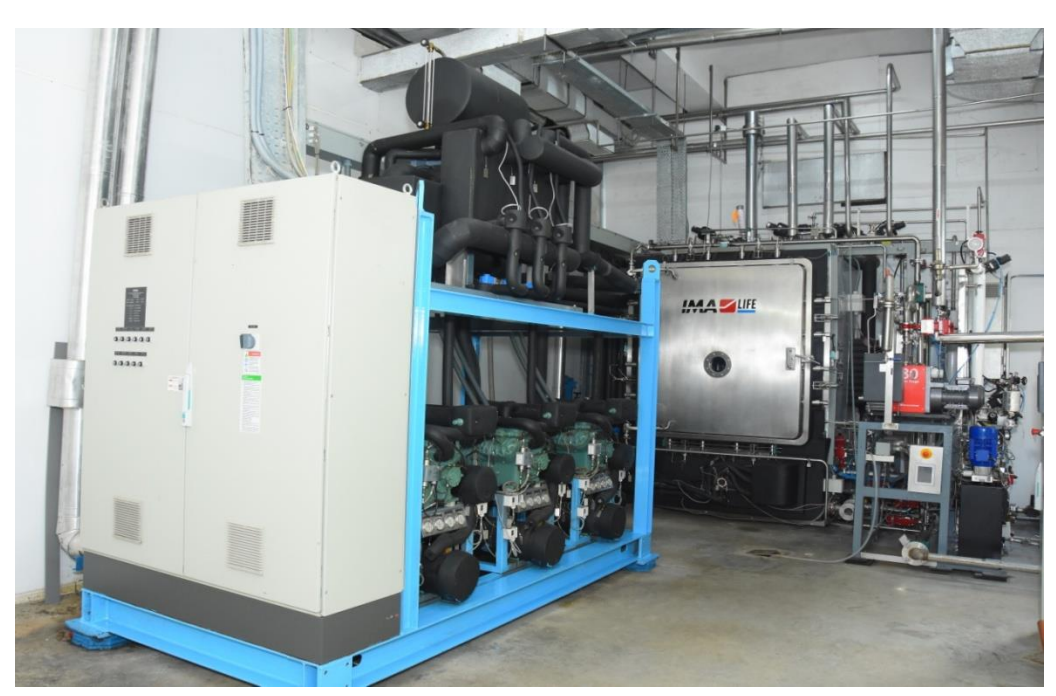
Lyophilizer technical area