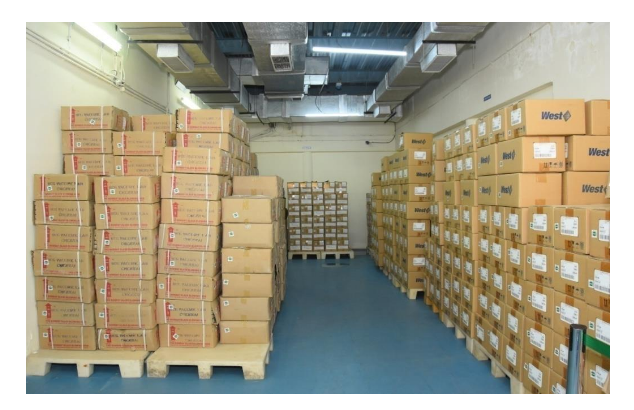
Primary Material and Package Store