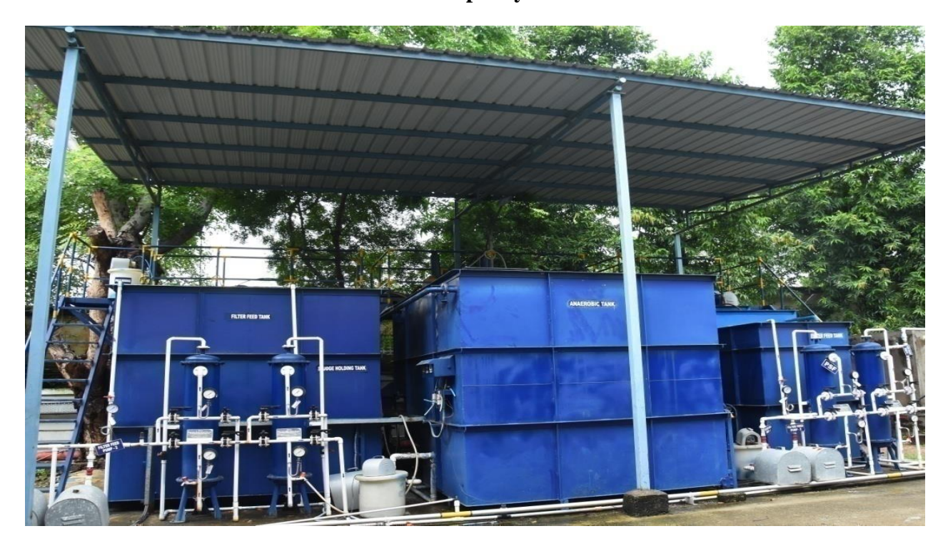
Effluent Treatment Plant (15KLD capacity) and Sewage Treatment Plant (4KLD capacity)