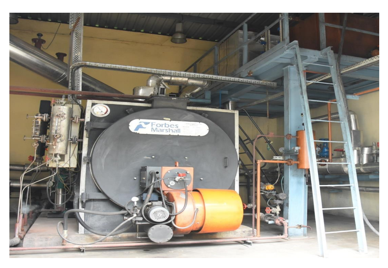
IBR Boiler with capacity 1.5 tonne